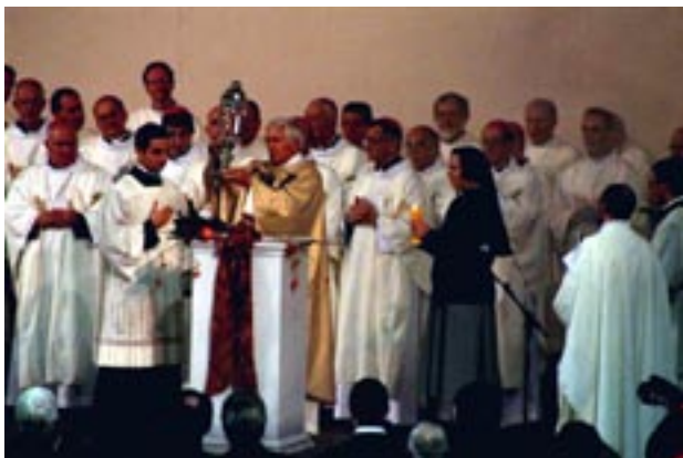
The procession of the Relic