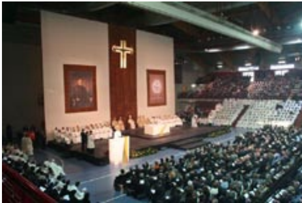
The Responsorial Psalm